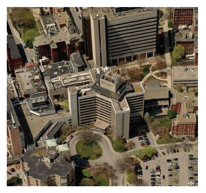
In 2013, the Environmental Protection Agency enacted the National Emission Standards for Hazardous Air Pollutants for Reciprocating Internal Combustion Engines (NESHAP/ RICE) to regulate pollutants emitted from stationary diesel engines. Part of those standards allowed for the limited

For Rhode Island Hospital, optimized demand-side energy management utilizing its diesel generators was essential in offsetting its energy spend.